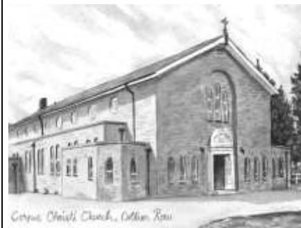
Corpus Christi Church, Collier Row